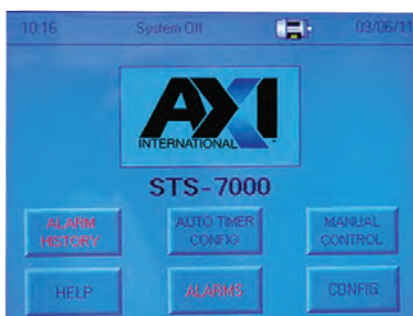
TOUCH PANEL MENU STRUCTURE